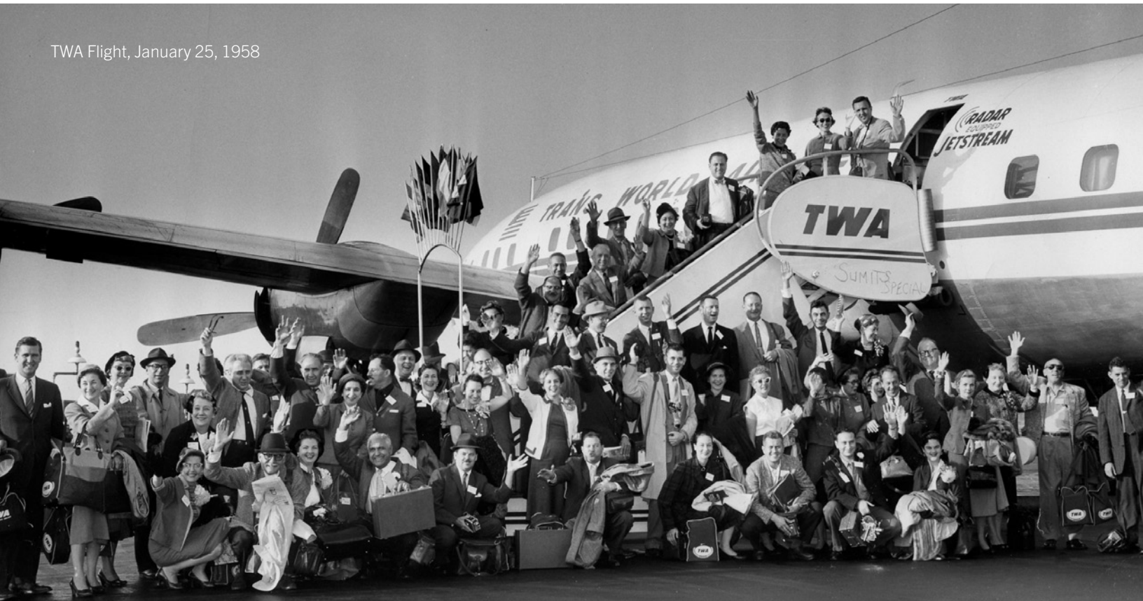
TWA Flight, January 25, 1958